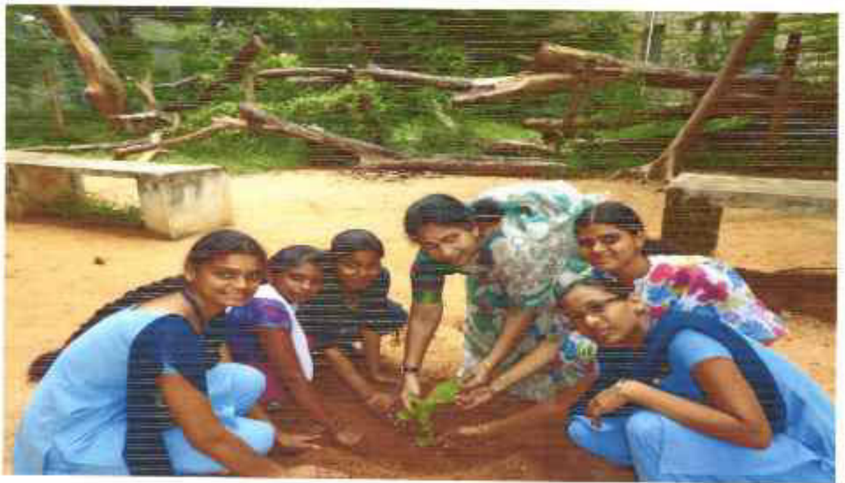
Service for the Mentally Challenged in the Residential Care Center, 2015