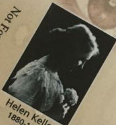
Helen Keller 1880-1968