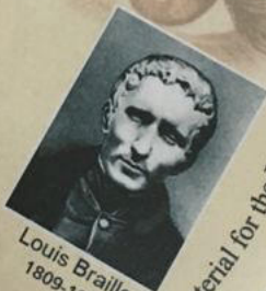
Louis Braille 1809-1852