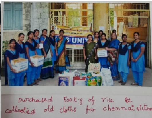
purchased 500kg of rice & collected old cloths for Chennai victims.