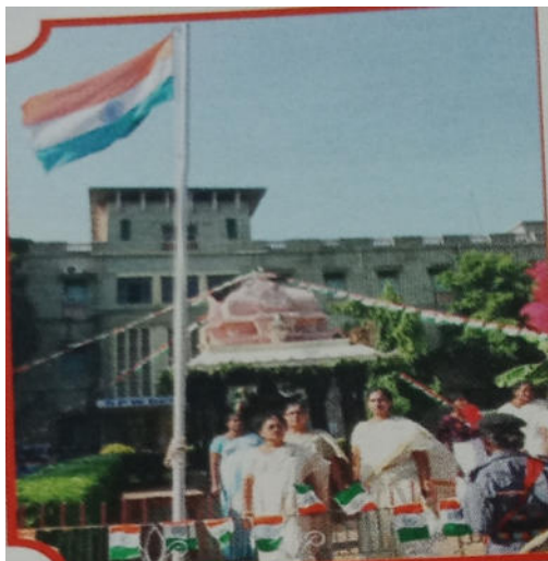
Sang a Song on 15.8.2015 Independence day