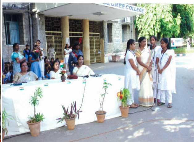
Poster Presentation done by II MAs Students in view of Independence day on 15.8.15 Quit India Movement & Non Cooperation Movement